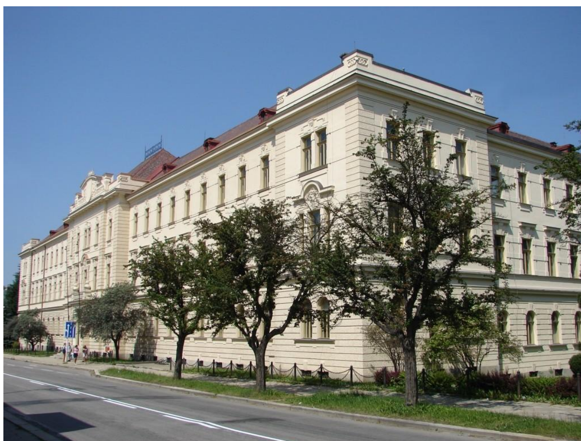
College of Polytechnics Jihlava

Tolstého 16 586 01 Jihlava Czech Republic www.vspj.cz