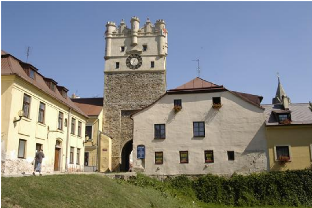
Gate of Holy Mother in Jihlava

above the ground all around the building up to the 1st floor and are from the latest gothic era. More information about rebuilding and architectural changes of the city hall is available from 1425 and later. The first renovation was done in 15th century and had a lot to do with the occasion of Basle's assembly July 5th 1436. The next important rebuilding was done in connection with the events of 1505.