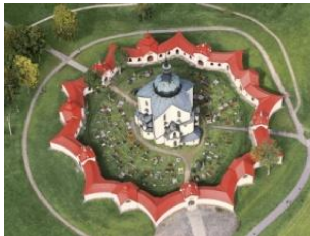
UNESCO Sightseeing in Žďár nad Sázavou town

At the beginning of the 18th century an architectural style unparalleled in the rest of Europe developed in Bohemia. Known as Baroque Gothic because it involved the transposition of Gothic elements into Baroque form, it was the style in which the Church of St. John of Nepomuk on Zelena hora (Green Hill) was built in the years 1719 to 1722 near the town of Zdar nad Sazavou.