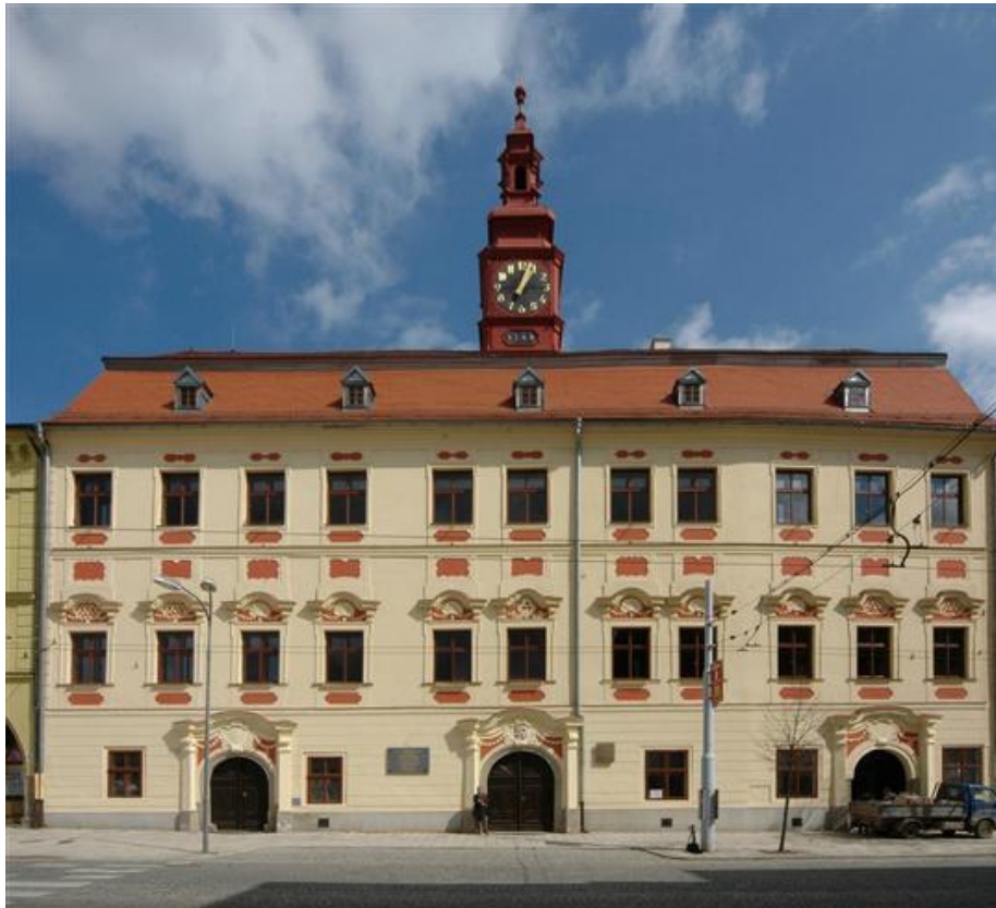
Town Hall of Jihlava

The continuing Life – Long Learning programs include the University of the Third Age.